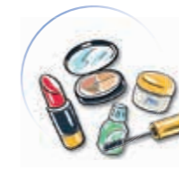
› COSMETIC INDUSTRY