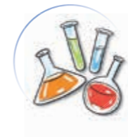
› CHEMICAL INDUSTRY