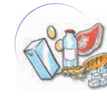
› FOOD INDUSTRY