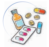
› PHARMACEUTICAL INDUSTRY